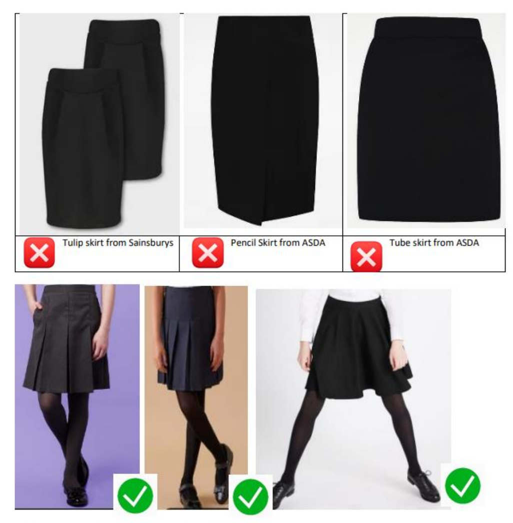
Examples of skirts worn with tights which are acceptable